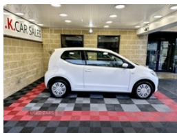
2013 Volkswagen Up 1.0 Move Up